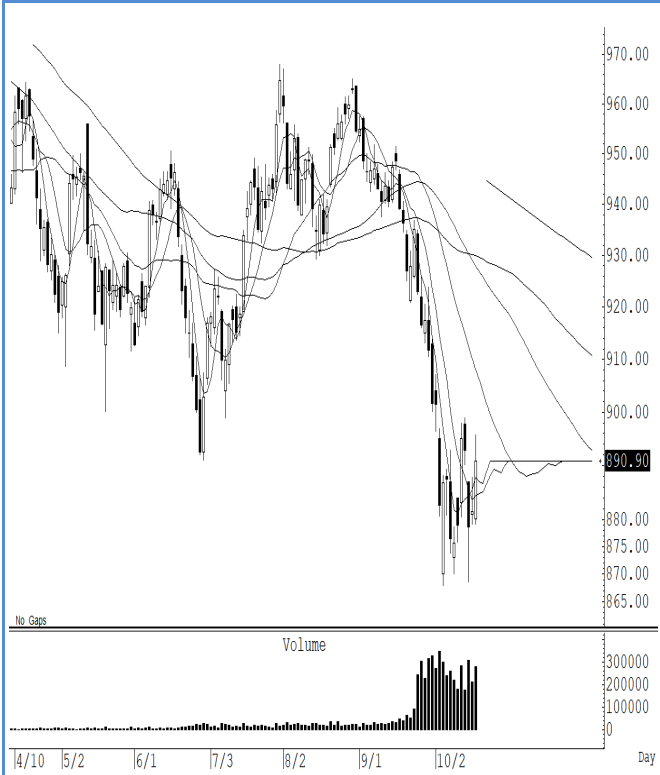
S50Z23 (Close 890.90 Chg 9.40)